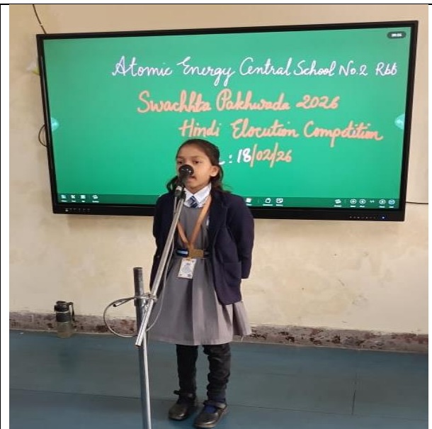
An elocution competition was conducted for classes IV and V to enhance speaking skills of students and spread awareness about cleanliness and health.