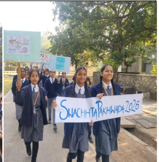
A spirited Swachhta Rally along with a human chain was organised to spread awareness about cleanliness in the community.