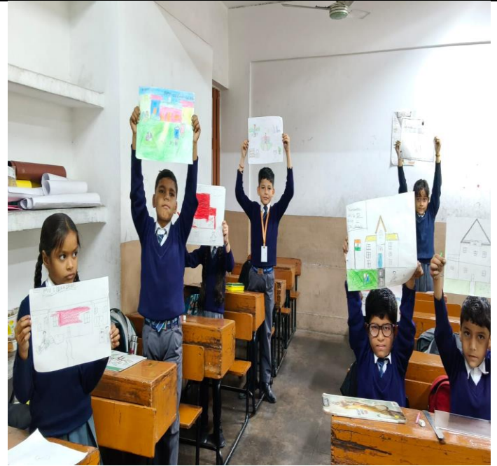
A drawing competition for Classes I and II was held on the theme "My Clean School" to nurture creativity and drawing skills along with the thought of cleanliness.