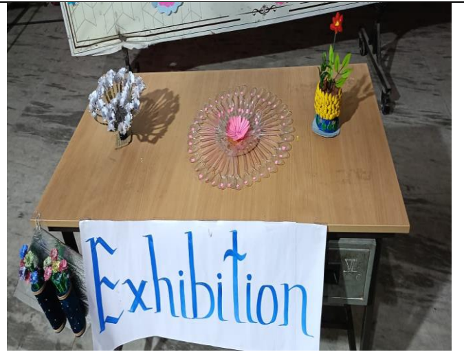
A creative “Best Out of Waste” competition was conducted, inspiring students to transform waste materials into useful and decorative items.